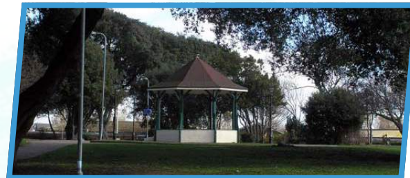
Up to 20 at The Harwich Bandstand

Is the Performing Arts equivalent of 20cm x 20cm. Anyone can book a slot up to 20 mins' duration in one of several sessions throughout the Festival to be held at the Bandstand in Cliff Park. These will be advertised in the Festival Programme. Please call into the Harwich Box Office or go online to book your slot.