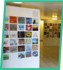
20cm x 20cm Project

By popular demand the 20cm x 20cm exhibition will run again in 2018. This is an open exhibition of paintings, collages, reliefs, textile art, montages and photographs. The only limitation is that submissions must be 20cm x 20cm. Many of the works are for sale at very reasonable prices.