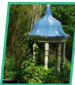
Garden of Curiosities